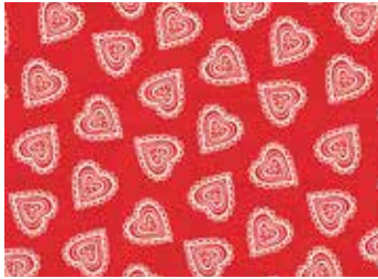
*1969 S Hearts