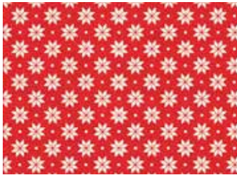
*1789 R6 Nordic Snowflake