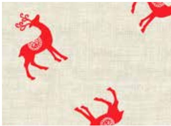
1967 R Reindeer