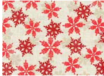
1968 R Snowflakes