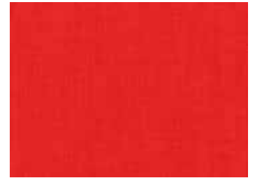
*1473 R Linen Texture