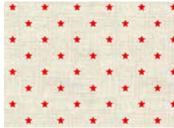
*1615 R4 Mini Star