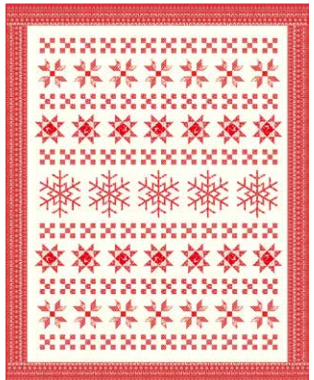
Finished size 60" x 75" (1.5m x 1.9m) Designed by Lynne Goldsworthy of lilyquilts.blogspot.com using the Scandi 2018 collection from Makower UK Download instructions free from www.makoweruk.com *Designs used in quilt