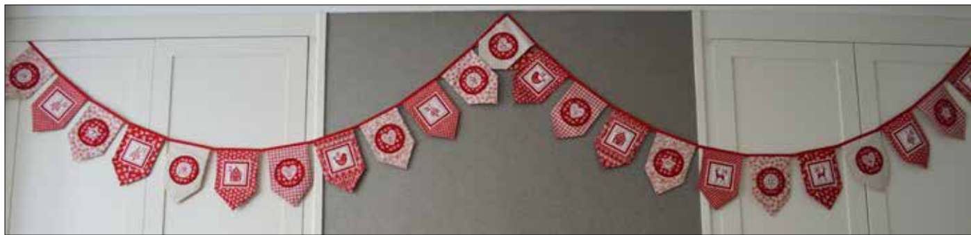
Scandi Advent Bunting