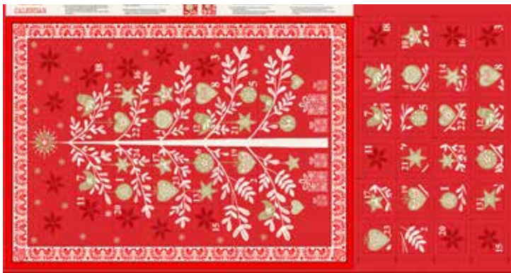
1970/R Tree Advent with metallic detailing Each panel 24" x 44" (60 x 112cms)