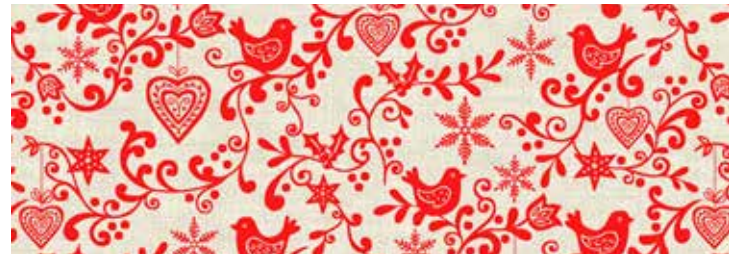
*1965 R Scroll