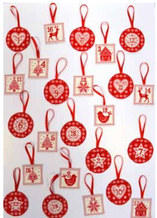
Scandi Advent Tree Decorations