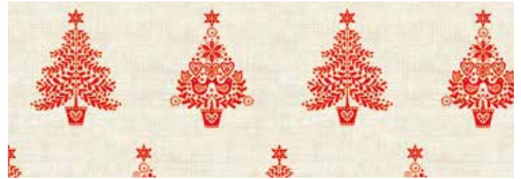
*1963 R Trees