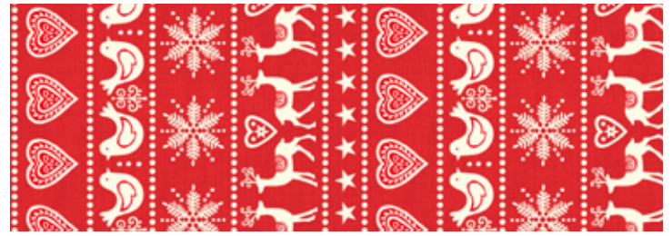
*1964 R Stripe