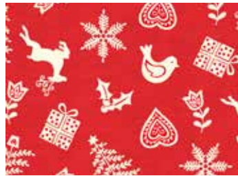
*1966 R Scatter