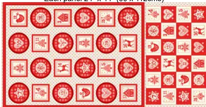
1971/1 Pocket Advent - Each panel 24" x 44" (60 x 112cms)